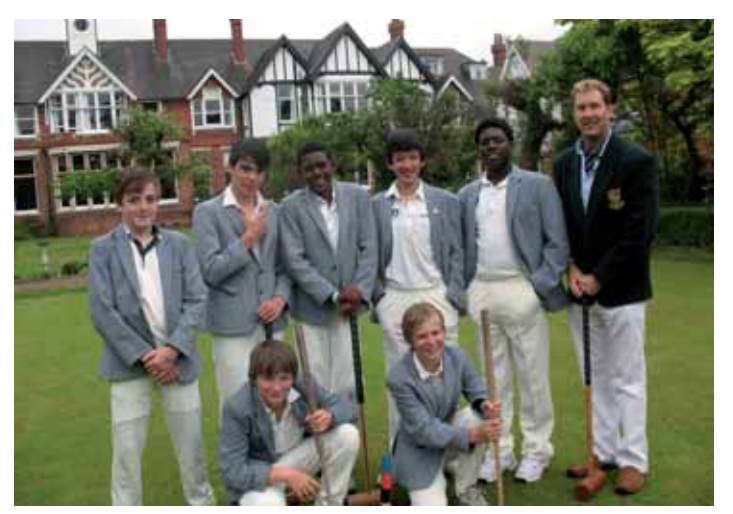
The victorious croquet team