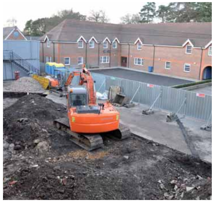
Alterations in the Square