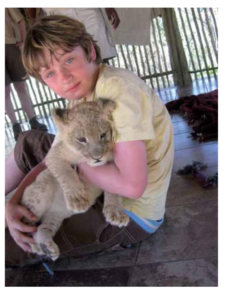
Happy memories of the trip to South Africa

Other visits included the one to the Bush Baby and Monkey Sanctuary, where the boys were met by the pickpocket monkey, and the day at the Pilansberg Game Reserve with all its hippo, elephant and lots of smaller game. They also had a morning of rafting on the Crocodile River and a visit to Sun