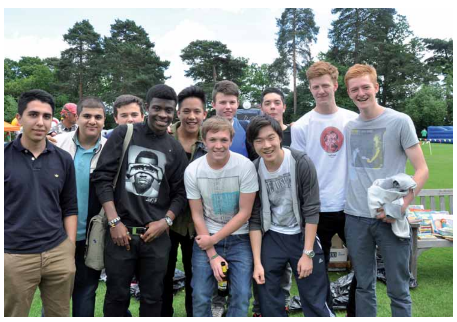
Visiting Old Boys, back for the Hog Roast last year

The Bibliomaniacs are a small group of boys, aged between ten and thirteen, who are interested in the history and culture associated with antiquarian books. 2012 was a year full of visits to second-hand bookshops, the Eton College Library and the British Library. These trips enabled the boys to see in person examples of what they had been studying. For instance a matter of weeks after