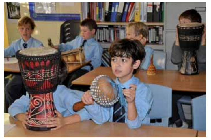
Learning about Nigerian music on Language Day

European Day of Languages is celebrated on the 26th September every year, demonstrating the importance and need for languages, as it is estimated that twenty languages die every year. So annual workshops are set up by the French department to promote languages. Since many boys at Papplewick come from a wide variety of countries like China, Japan, Russia and Malaysia all the workshops can be led by parents of such boys. They included lessons on Japan, Thailand, Nigeria, Korea and Senegal, which entailed some writing in Japanese using special pens, like paintbrushes, and writing on rice paper.