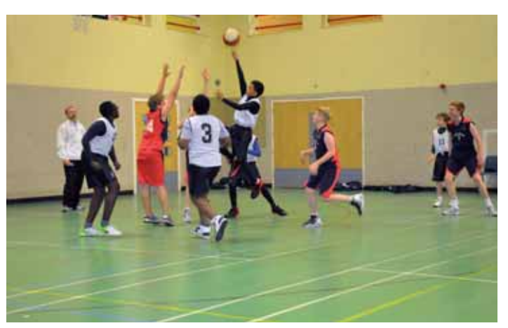
Basketball is becoming increasingly popular

The Colts squad had five fixtures and put in some excellent performances. The best of those was against Yateley Manor with a 31-3 victory. The successful season came as a result of considerable skill, hard work and a good deal of determination.