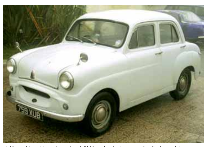
A 'Spanking New Standard 8' like the beige one Rodie bought

I also remember Rodie purchasing a brand spanking new beige Standard 8. At a time when most cars had mudguards, separate headlights and running boards, the all-enveloping bodywork impressed us boys greatly.