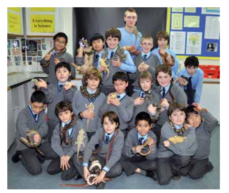
Herpetology is going from strength to strength