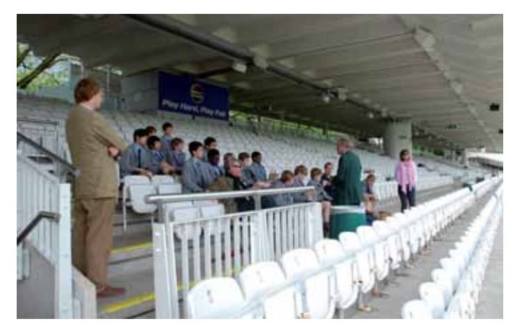
Year 7 visits Lords