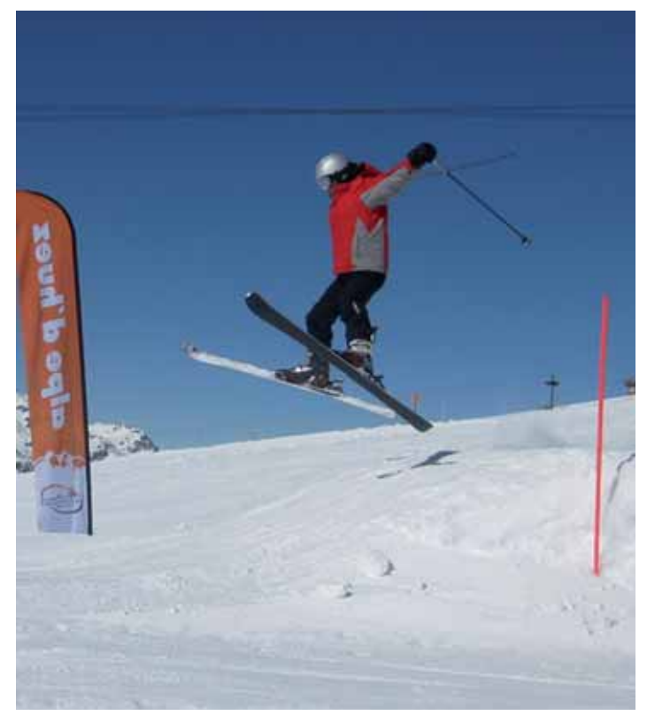
Controlled ski jump in Alpe D'Huez

City - South Africa's most famous resort – where they visited the crocodile farm. The last full day was spent at the Lesedi Cultural Village, where the boys learnt about local tribes in typical villages. This was followed by traditional dancing and singing, which rounded off a wonderful 2012 trip.