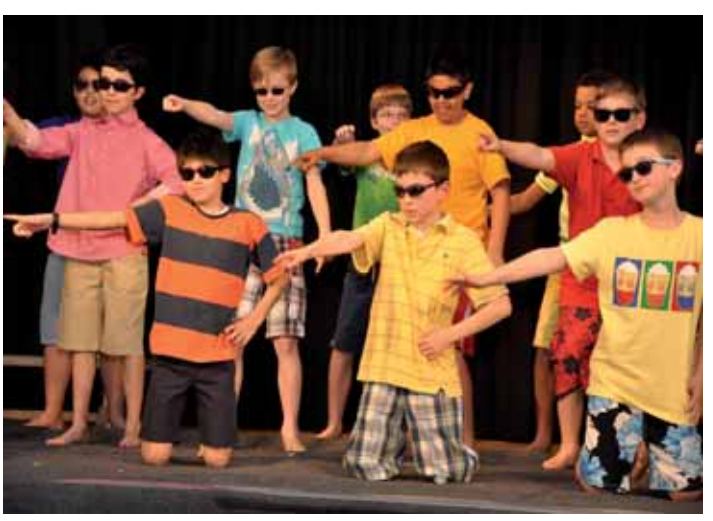
Papplewick's Got Talent in Year 5

Papplewick's Got Talent - This was Variety in its purest form, not just in terms of content but also quality. The judges were genuinely impressed by the gusto with which every line was sung or danced to, and in the end only half a point separated the top two. The acts all oozed quality from every pore and after a recount Seven Up, with keyboards, bassoons, percussion and vocals carried the day, with a most entertaining performance.