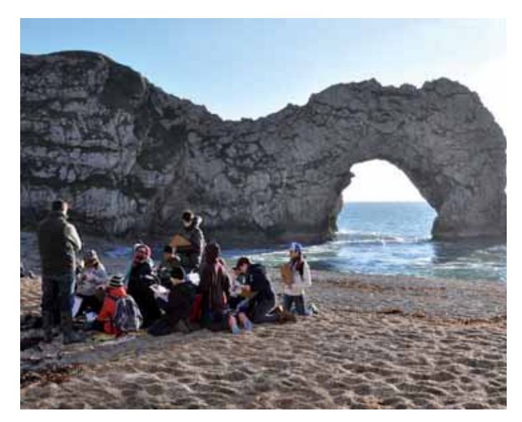
Year 8 Geographers at Durdle Door, on the Jurassic Coast

learning about the King James Bible, they travelled to Eton and saw the real thing. But the outstanding experience was undoubtedly the trip to New York City, where the bibliomaniacs learned a great deal about books, manuscripts and art from two experts who catalogue books and manuscripts on behalf of Arader Galleries. Over the four days the boys were there, they were shown several examples of ancient atlases, they visited the New York Society Library, they had a bookbinding session and they took a trip to the National History Museum Library.