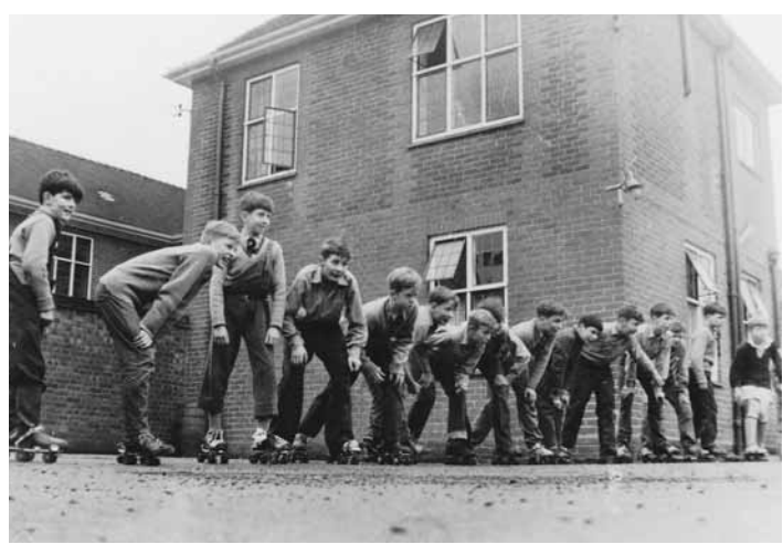
Does anyone recognize any of these roller skaters?

May I make my annual plea for Old Boys who read this to go to the Old Boys' Page of the School web site (www.papplewick.org.uk and click on About Papplewick and Old Boys.) If you click on the 'Missing Old Boys' icon you will have an opportunity to help locate those Old Boys with whom we have lost contact and whose addresses you may know. Sadly, each year we lose more than we gain.