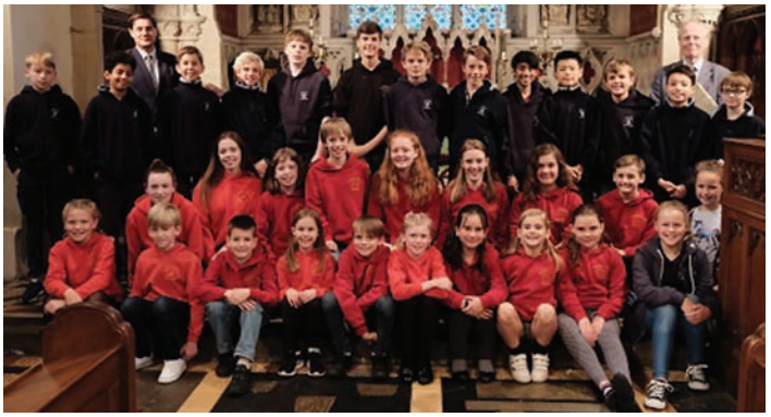
The Choir sings at St Andrew's Church in Sonning. (see page 13)

The First Choir has enjoyed a busy and productive year. A new rehearsal regime saw boys practising before Chapel four mornings a week with several boys moving permanently to the altos. With two parents joining the tenors and the new Director of Music the basses, the choir's ability to sing balanced fourpart harmony was enhanced and several anthems were sung unaccompanied, with assurance. With some very good lead