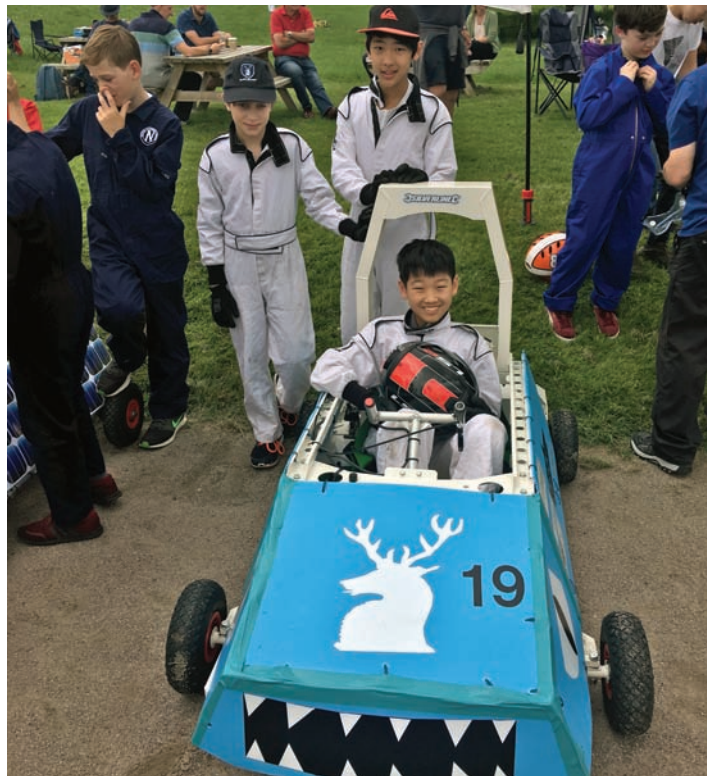
Papplewick's Award-winning Kart

Papplewick's Got Talent 2018 – Having danced his way to triumph in 2017, the same performer overcame all opposition once again last year, with a 'Greatest Showman' themed ballet and contemporary dance to 'This is Me'. What a dance and what a way to head home for the half term break!