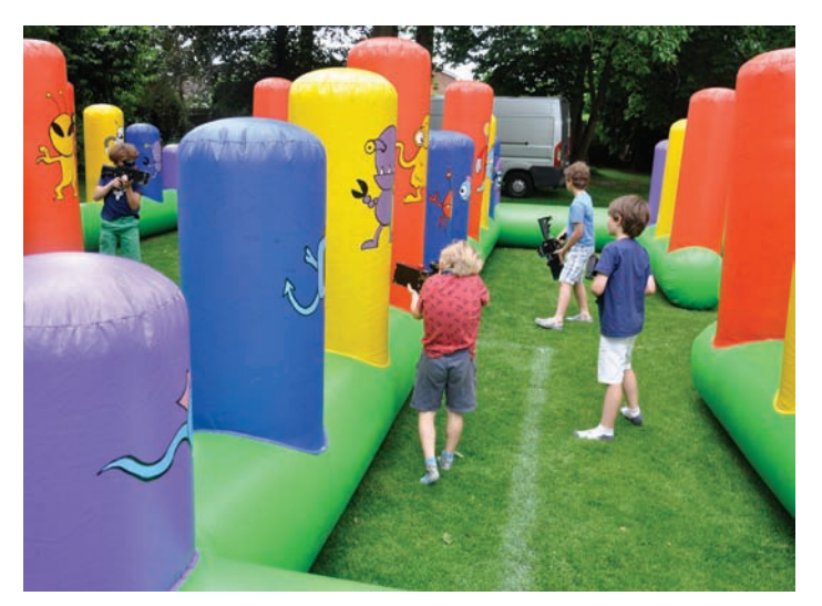
The Hog Roast 2018

term in recognition of his distinctive and original contribution to the academic, co-curricular, cultural and moral life of the school'. Well, I hope this year's leavers will follow in those boys' footsteps. Such values stem in part from our desire to be a family school at heart and how apt that the Good Schools Guide, that publication defined as 'a frightful old rag' if its report is negative, but as 'the bible itself by which all parents should choose a school' if positive, reported, 'We're trying not to think of Papplewick as the Prince Harry of the school world but if it were human, you'd definitely be attracted to its quirkiness, sense of humour, wit and kindness... rather than any trace of flawless beauty.'"