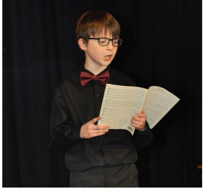
One of the finalists performing in the Arts Festival

The sun shone on boys, parents and teachers at their annual charity walk around Windsor Great Park on Sunday, 22nd April. The purpose of the eight-mile walk was to raise funds for the charity, 'Railway Children', with the aim of reaching a target of £13,000 or more. The charity helps children living on the street in the UK, India and East Africa, where they suffer abuse, violence and poverty. All participants greatly enjoyed the walk and the picnic afterwards. We are extremely grateful to everyone who contributed so generously; we reached our target at the first count, raising a remarkable £15,000, and a further £4,000 was forthcoming from subsequent donations towards this very deserving charity.