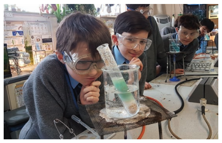
Scientists at work

Papplewick enjoyed an action-packed week for the Arts Festival at the end of the Lent term. The theme was 'All Creatures Great and Small' and it was fantastic to see the school come