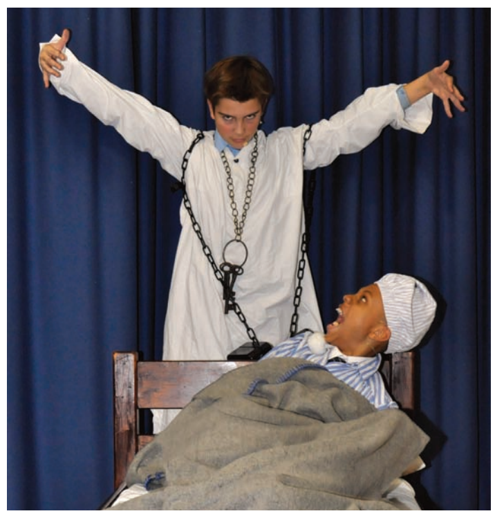
'Ebenezer' – the main drama production of the year

It is now impossible to avoid drama at Papplewick with nearly half the school taking LAMDA lessons, and seemingly a performance of one sort or another rolling off the production line every few weeks. How we enjoyed the high standards of the production of 'Ebenezer' before Christmas, the infectious enthusiasm of the Years 2, 3, and 4 Variety Show, the high-brow humour and sheer gusto of 'Pirates of The Curry Bean,' the complete professionalism of 'Julius Caesar', the spine-tingling spookiness, and courage, of staff and parents in 'The Ghost Train', the not too polished Papplewick's Got Talent but with a winner with bags of polish whom we hope is destined for great things in the world of ballet, and finally, the surreal variety of the Year 5 Variety Show.